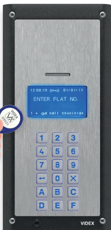
4812/4G mounted with 2-module flush kit 4852

Allows communication between an external location and any fixed or mobile telephone number, integrating the management of the SIM card inside the device.