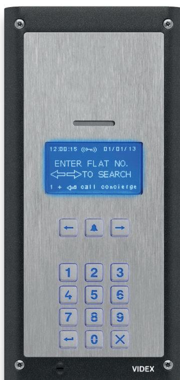
4812R/4G with repertory name facility, mounted with 2-module flush kit 4852